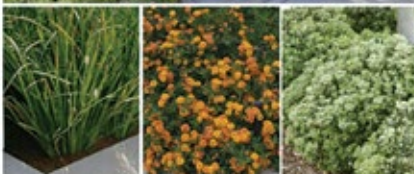
Wild Yellow Iris